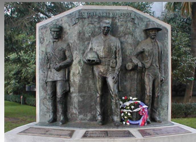
California Peace Officers' Memorial in Sacramento, unveiled on May 13, 1988, and is dedicated to the brave men and women of law enforcement who have died in the line of duty.

Saturday, May 8, 2010 Shadow Cliffs Regional Park in Pleasanton, CA